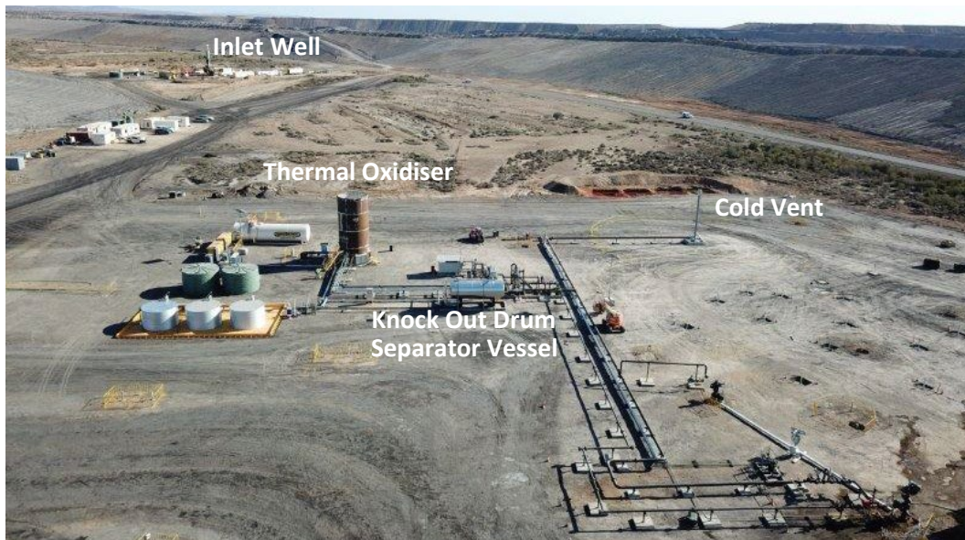
LCEP First Syngas Production Facility

Leigh Creek Energy Limited (ASX: LCK) ("LCK" or "the Company") is pleased to announce that the Company successfully initiated the gasifier with the production of first syngas occurring on the 10 th of October 2018. This is a great endorsement of the LCK technical team, LCK's shareholders who have supported the Company, and LCK's management team and staff who have never wavered in their commitment to producing syngas.