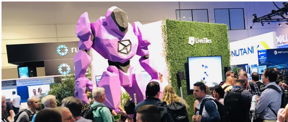
LiveTiles booth at Microsoft Ignite, September 2018 (Las Vegas)

In September, LiveTiles was a major sponsor of Microsoft's global Ignite conference in Las Vegas. This major marketing event, which was attended by over 25,000 participants, has already generated a substantial uplift in LiveTiles' sales pipeline.