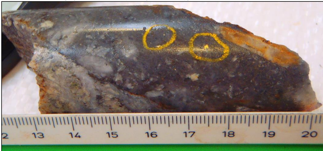
Photograph 1: Visible Gold (inside yellow circles) from 40.90m. Drill hole MSA29.

Targeted drilling is now continuing into the Stacpoole North Structure with drill holes MSA30 – MSA32 all intersecting the target horizon. Assay results for these holes are pending. Drilling is continuing from the current drill location.