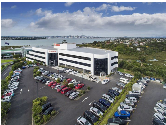
DPL Insurance Head Office 28 The Warehouse Way Northcote, Auckland

Going forward, stronger underwriting performance is expected to drive a greater balance of earnings. It has also said that the insurance division's ownership and affiliation with parent, Turners Automotive Group Limited, which is the largest retailer of motor vehicles in New Zealand, provides good access to business and creates a valuable distribution network.