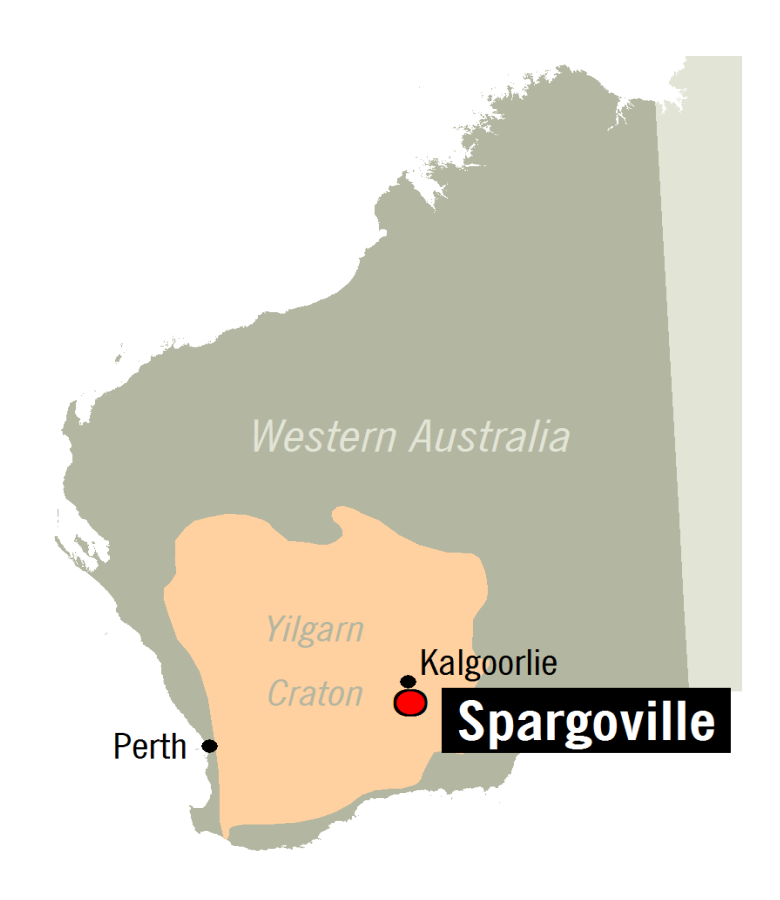
Figure 1: Maximus Project Location Map