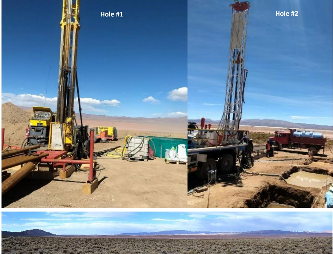
Figure 1 a,b,c,d: Lake's Cauchari Lithium Project – View looking north west from first diamond drill hole across the Cauchari salt lake towards adjoining Ganfeng Lithium / Lithium Americas resource and Orocobre / Advantage Lithium resource. Diamond drill rig looking east (Hole #1) and Rotary drill rig looking east (Hole #2). View of drilling area.