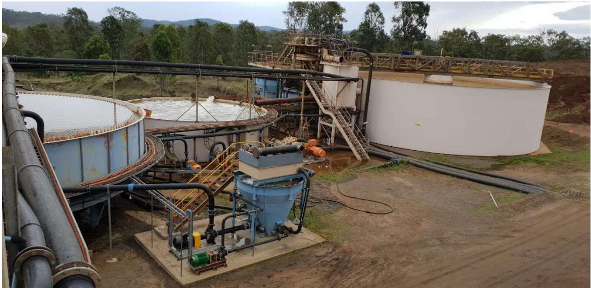
Photo 5. Thickeners removing the slimes