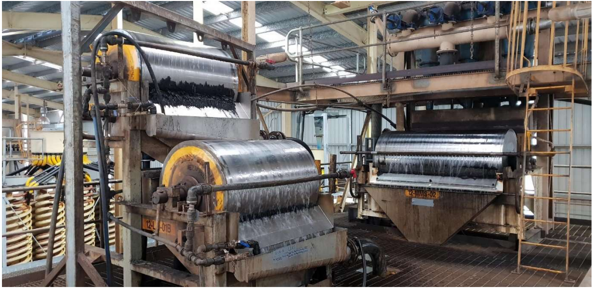
Photo 4. LIMS removing the titano-magnetite