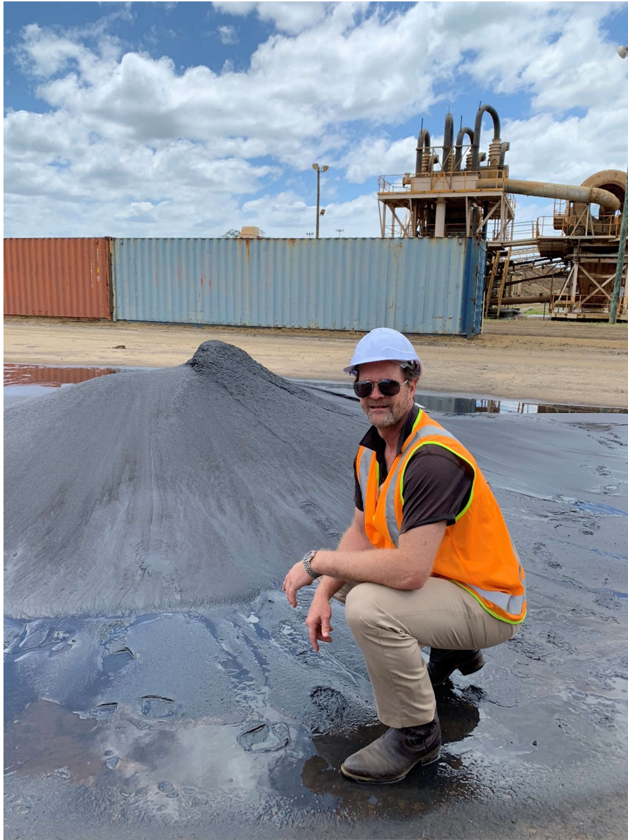
Photo 1. First ilmenite production