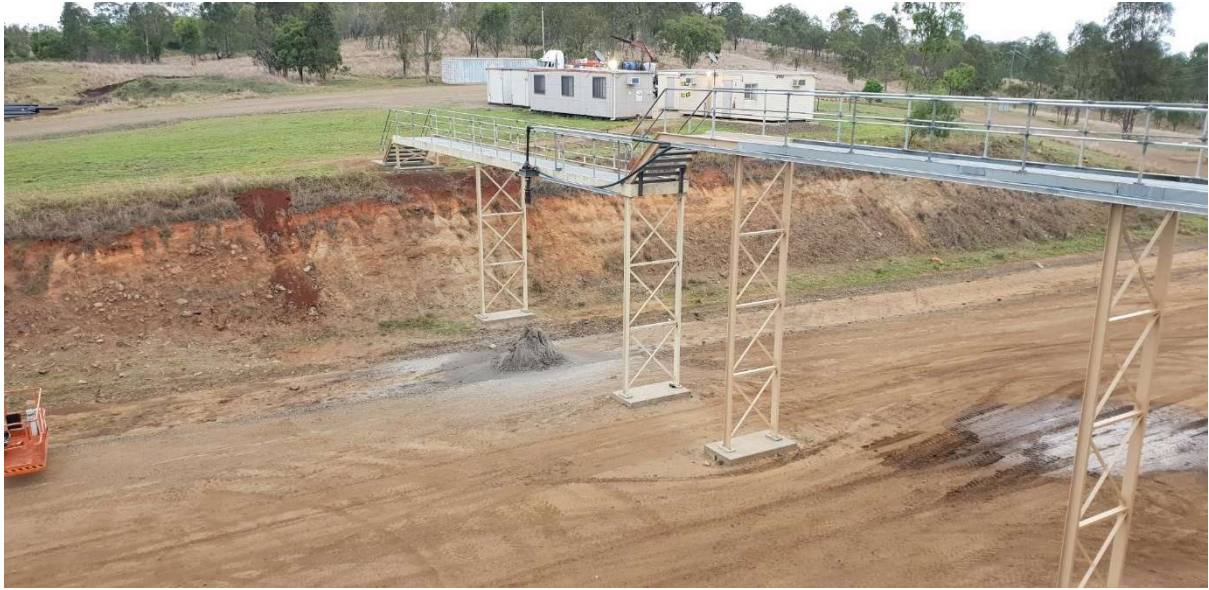
Photo 2. First apatite production