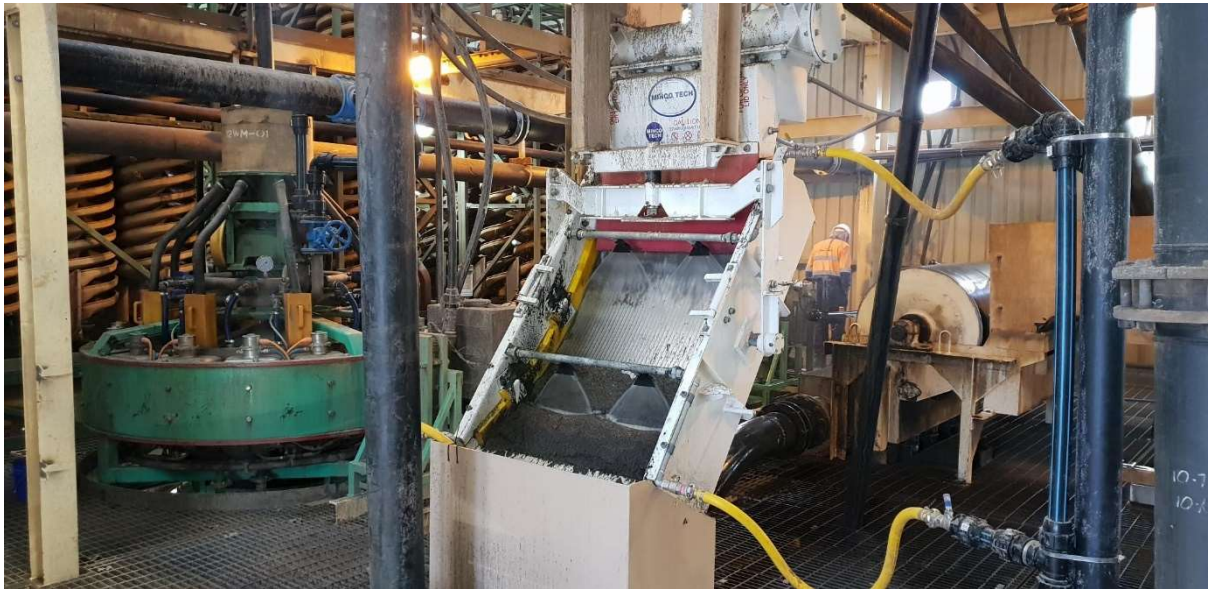
Photo 3. New sieve bend in action