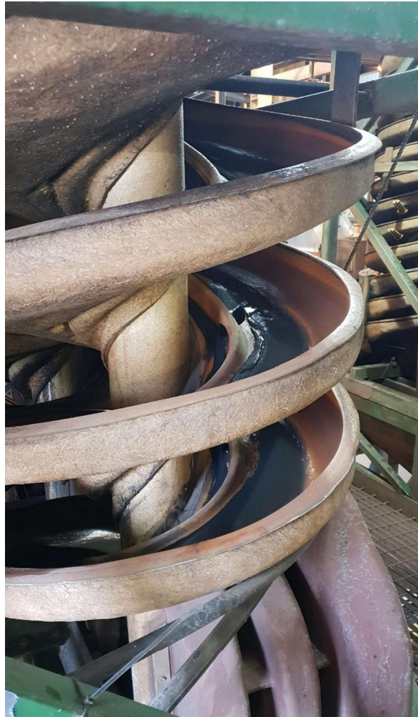
Photo 6. Spirals recovering the valuable HMS