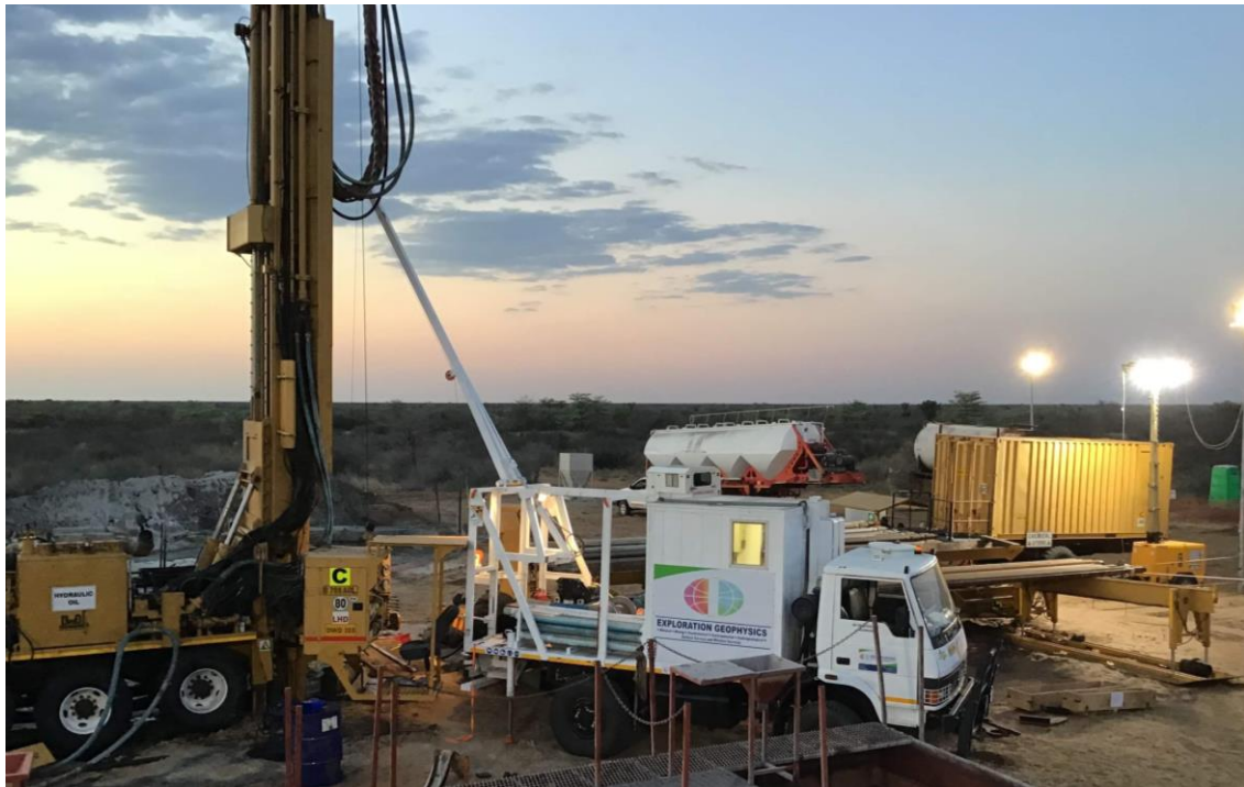
Well logging equipment on-site at Tlou Energy's Lesedi CBM Project, Botswana – November 2018