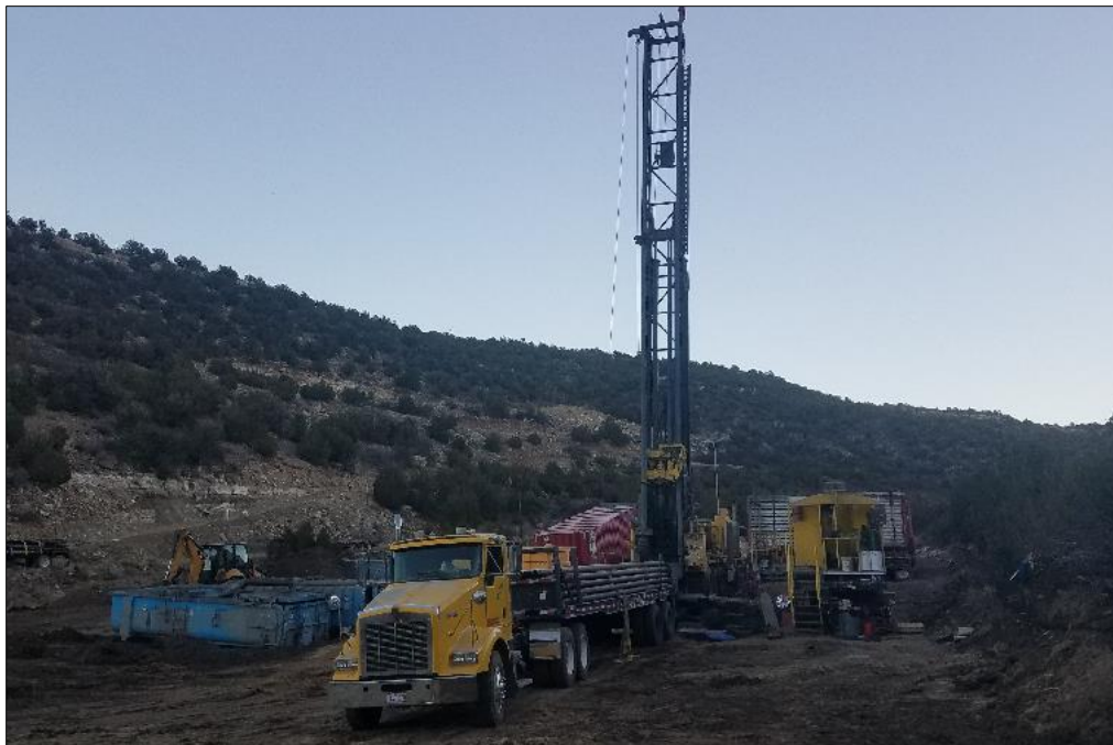
Figure 1 – Drilling Operations Underway on the Powell #23-25 Well

The Company looks forward to providing updates throughout the drilling program as well as updates on the testing of the Amerigo Vespucci #1 well.