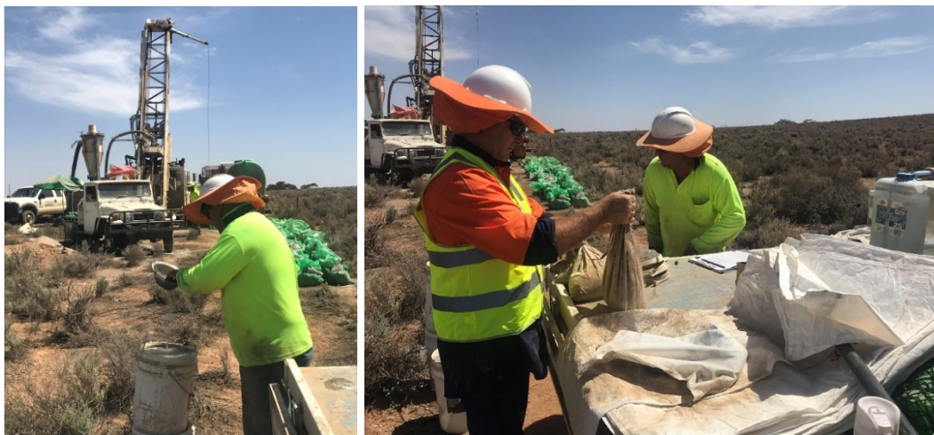
Fig. 2. Drilling at the Hood prospect at the Blue Hills Copper-gold Project.

In addition to the results from the three Hood RC drill holes, Archer has discovered albitite (a sodium rich rock) as float in the Hood area and also in situ between Hawkeye and Katniss. The vein nature of this material could be a “high level” type of rock/mineral, which exists above the actual granite intrusion. The presence of albitite supports the intrusive model being proposed for the large-scale mineralising system at Blue Hills.