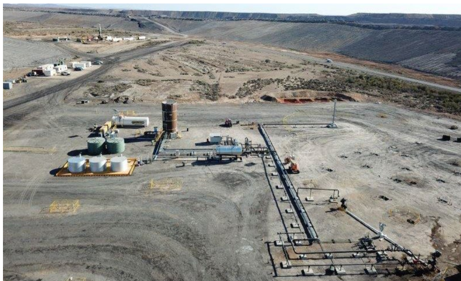
LCEP Syngas Facility

The PCD is providing information for the development of the commercial project and is demonstrating that LCK can operate the ISG gasifier safely and in an environmentally responsible manner. On 17 December 2018 LCK reported that “The first environmental results confirm the PCD is operating as expected, in line with scientific modelling. This evidence supports the Regulator and LCK’s claim the process can be done in a safe, regulated and controlled manner and that the Leigh Creek site is ideally suited to the ISG process.”