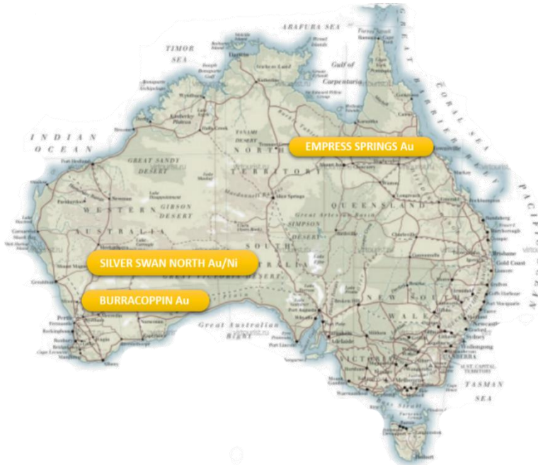
MAP OF MOHO'S PROJECT AREAS

On 7 th November 2018 Moho listed on the ASX, raising $5.3 million. As a result, the Company is well funded to advance exploration on its three highly prospective projects at Empress Springs, Silver Swan North and Burracoppin.