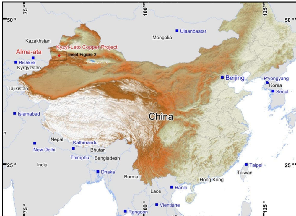
Figure 1. Fortune Asia Minerals projects location map.