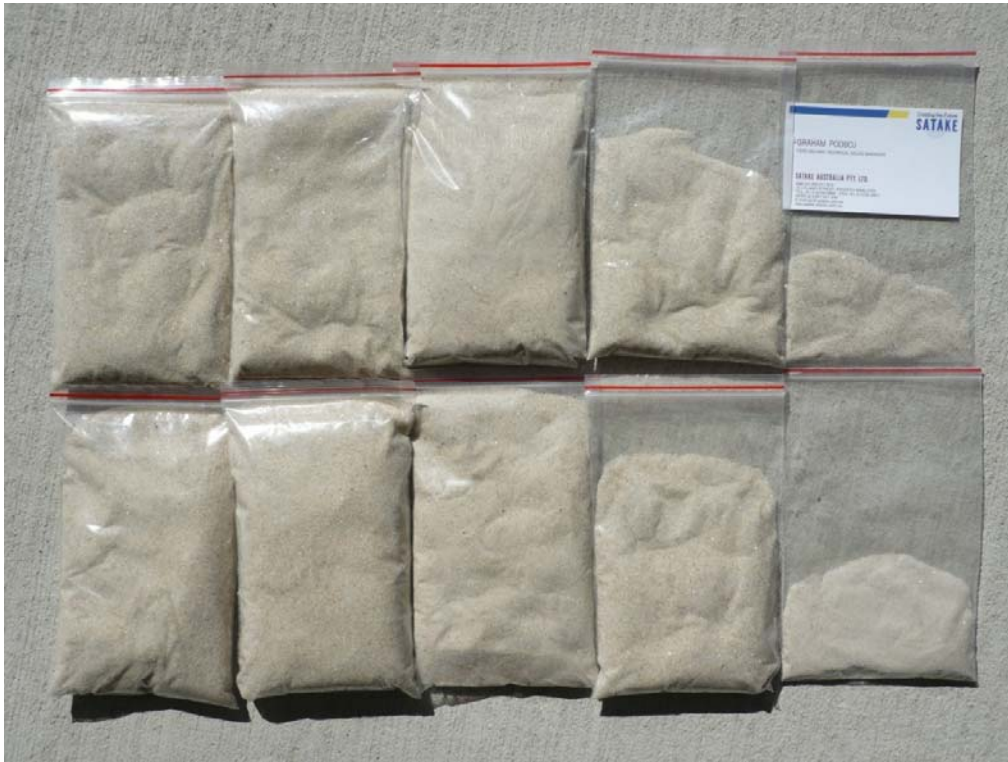
Figure 1: Satake Air Gravity Table Testwork

Chris Browne and associate Craig Clark then refurbished a larger circa 1950 air table that was in storage at Currumbin Minerals and undertook a range of trial-and-error detail studies (remembering that this equipment was pre-digital control era, see Figure 2 ).