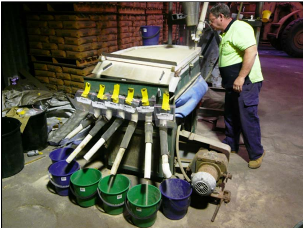
Figure 2: Air Gravity Table Testwork

Chris Browne and associate Craig Clark then refurbished a larger circa 1950 air table that was in storage at Currumbin Minerals and undertook a range of trial-and-error detail studies (remembering that this equipment was pre-digital control era, see Figure 2 ).