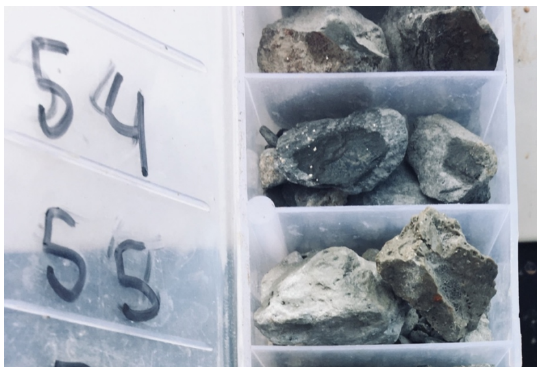
Plate 1. HDRC19-01 depths 54 and 55m showing the bleaching at 55m (sodic alteration).

The drilling results support the concept that the exposed mineralisation is proximal in nature to an inferred intrusion or intrusions located at depth immediately east of Hood, Hawkeye and Katniss (ASX announcements 7 February 2019, 22 February 2019 and 4 March 2019). The possible presence of these buried intrusions is important as the intrusions are most likely to be the main source of the mineralisation. In addition to the modelled intrusives, the review identified several conductors that run parallel to regional west-northwest and north-northeast structural trends. Confirmation of the interpreted intrusions would require further drilling.