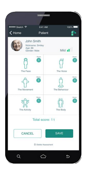
PainChek® six domains of pain assessment that calculates pain severity score

This data is then combined with other indicators of pain, such as vocalisations, behaviours and movements captured to calculate a pain severity score. Due to its speed, ease of use and its reproducibility, PainChek® will be able to be used to detect and measure a person's pain, and then further measurements can be used to monitor the effectiveness of pain management.