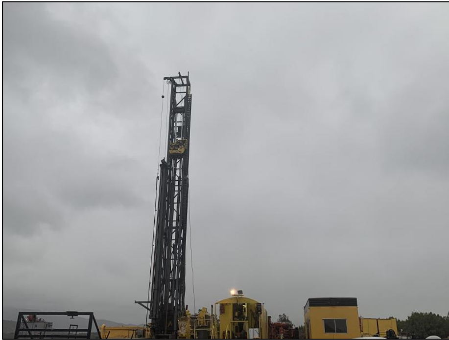
Figure 2: Drilling operations underway on the Amerigo Vespucci #1 well