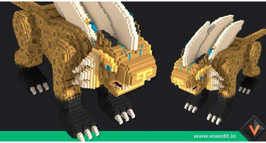
Example of Voxel Assets