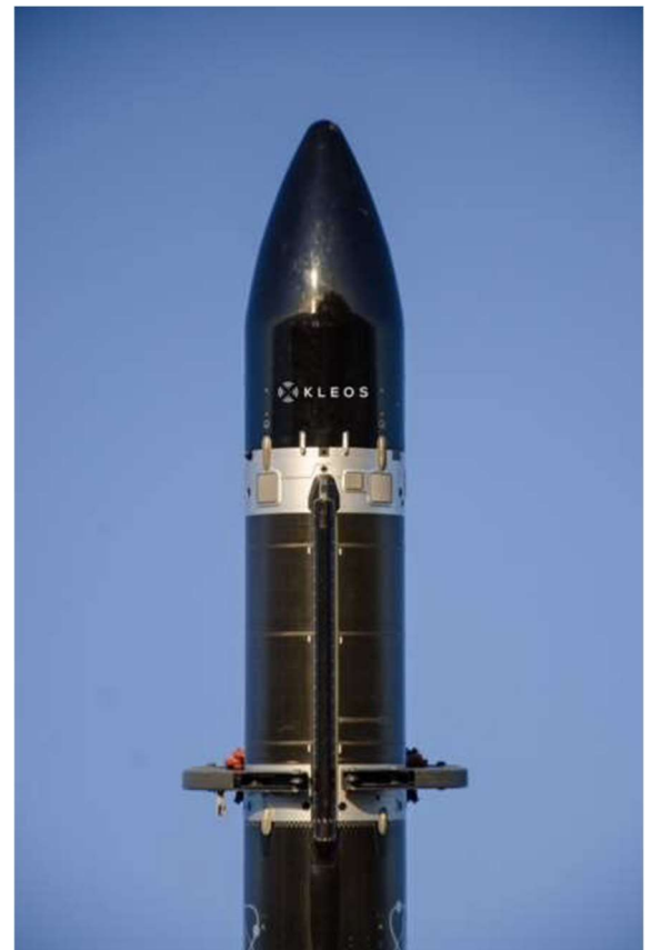
Rocket Lab Electron rocket

Pre-flight testing of critical functions within the detection systems on the satellites used for the creation of the Kleos geolocation data, have performed significantly better than specification, this improvement will further increase accuracy and product value.