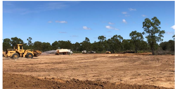
Image 1 & 2 show water over a road in the area affected by rainfall and drilling pad construction activity.

Ensign Rig 932 will first mobilise from Moomba (where it is currently stacked) to the Albany 2 wellsite when the roads have dried sufficiently. It is envisaged, provided no further rainfall occurs, that the rig move will begin in early to mid-June. It is estimated that it will take two weeks until the rig is fully rigged up on the Albany 2 pad and is ready to spud.