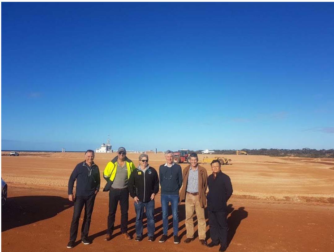
Figure 2: Chinese company representatives and Andromeda directors at T-Ports Lucky Bay port facility

Following the visit, the Chinese company expressed interest to progress discussions with Andromeda for a premium kaolin product as well as collaborating on potential HPA production in China.