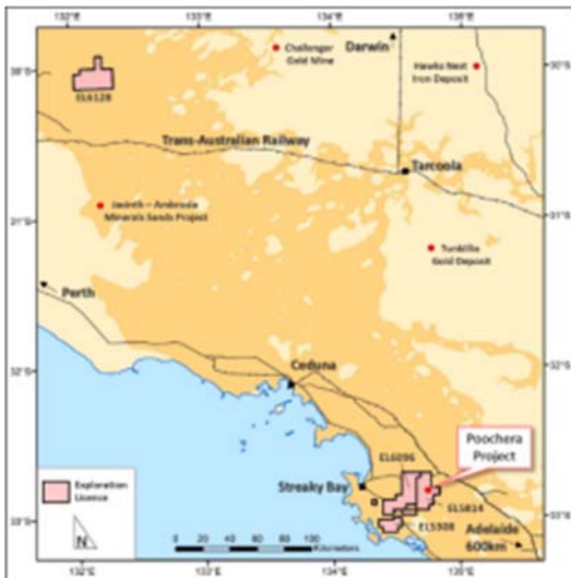
Figure 4: Project location plan

Peninsula which comprises three tenements and is located approximately 635kms west by road from Adelaide and 130kms east from Ceduna (Figure 5).