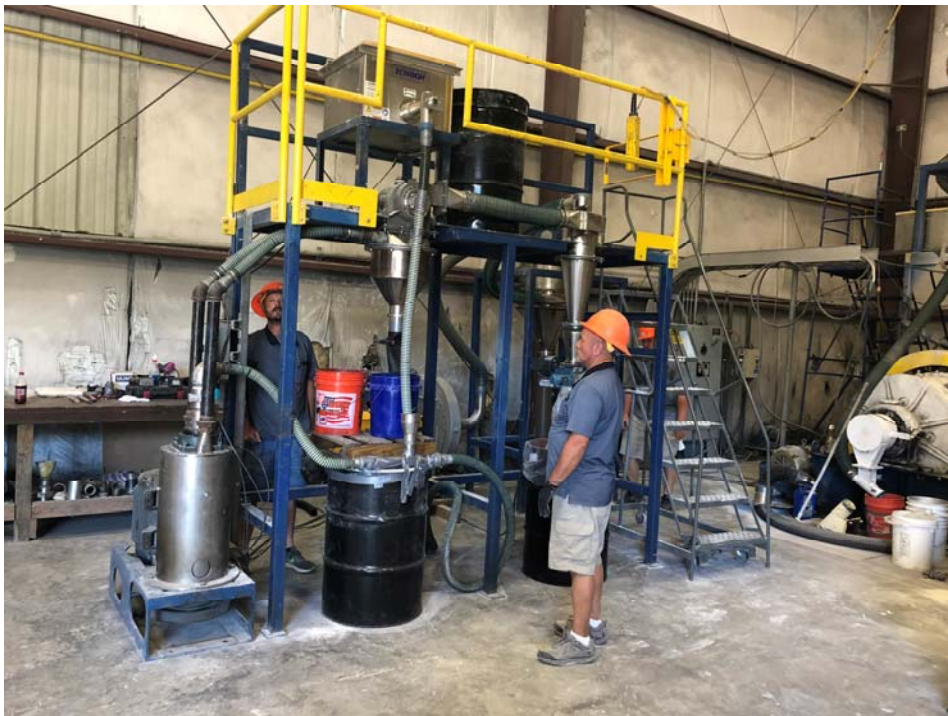
Figure 3: Dry processing trials performed on Carey's Well ore by USA leader in kaolin plant design

Dry-processing trials, with Andromeda executive management in attendance, were conducted during the previous week on a 500kg sample of raw ore from Carey's Well by an American world leader in the design and supply of kaolin plants with the objective to determine optimal plant componentry and operational parameters. Samples from this processing will be freighted back to Australia for analysis before a final optimisation run is undertaken later in the month. All data collated from these trials will be compared with large scale trials already conducted in Australia and China. Additional dry-processing trials will be conducted with another Chinese company during June to obtain further data for process plant design optimisations.