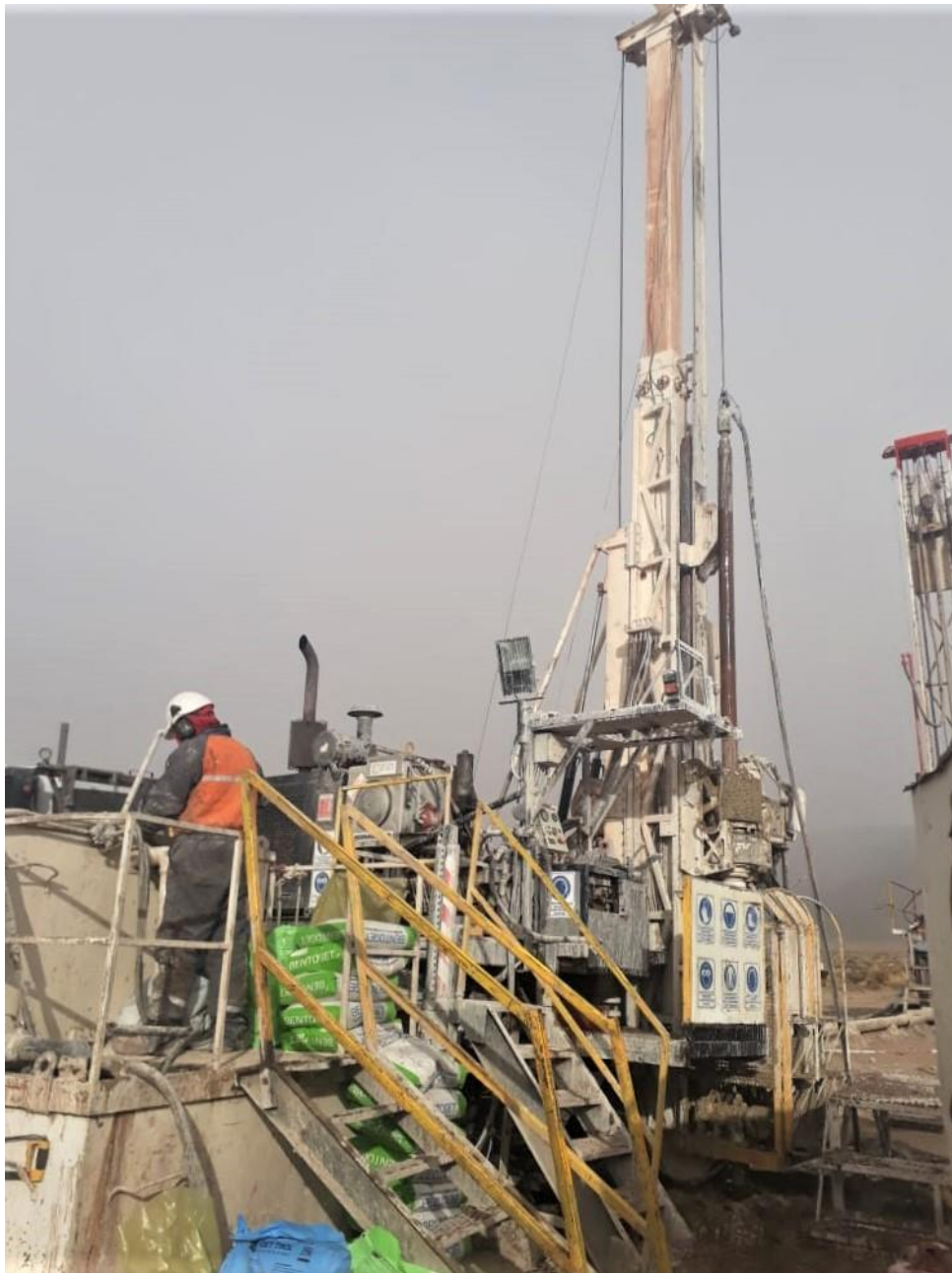
Figure 1: Foraco diamond drill rig at Lake's Cauchari brine project

Follow Lake Resources on Twitter: https://twitter.com/Lake_Resources http://www.lakeresources.com.au