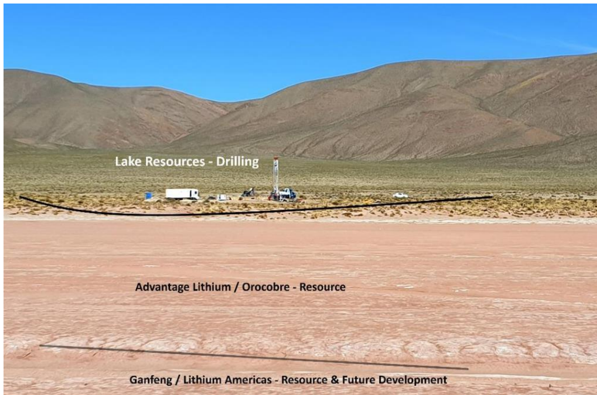
Figure 2: Location of LKE's drill operations at Cauchari in relation to Advantage Lithium/Orocobre & Gangfeng/Lithium Americas leases. (Note: The marked boundaries are indicative only. Please refer to the detailed map).