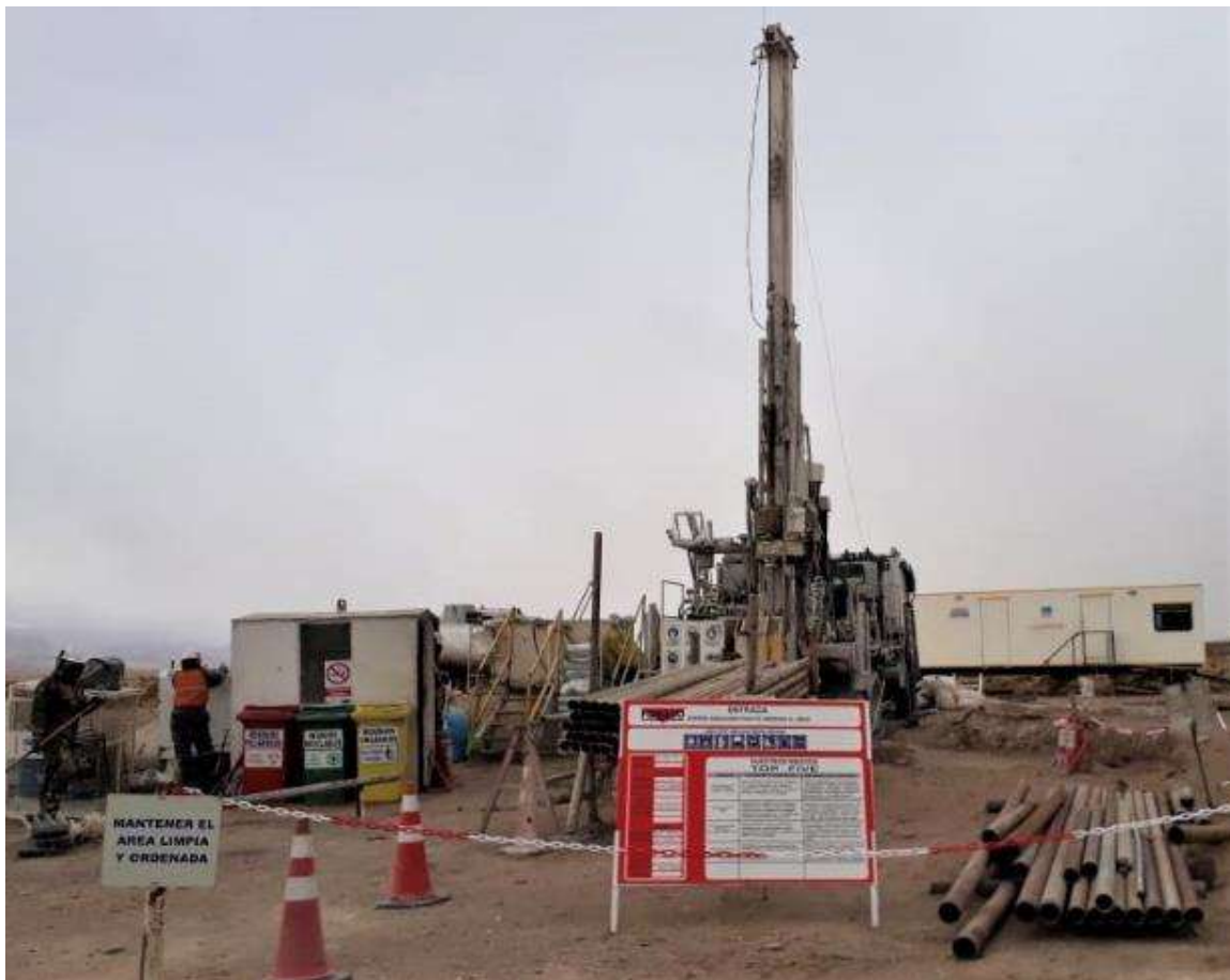
Figure 1: Foraco diamond drill rig at Lake’s Cauchari brine project

1 Refer ASX announcement 27 November 2018.