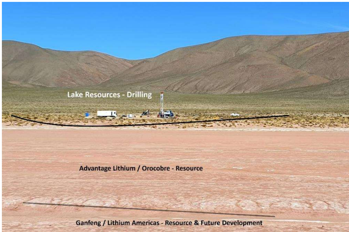
Figure 2: Location of LKE’s drill operations at Cauchari in relation to Advantage Lithium/Orocobre & Gangfeng/Lithium Americas leases. (Note: The marked boundaries are indicative only. Please refer to the detailed map).