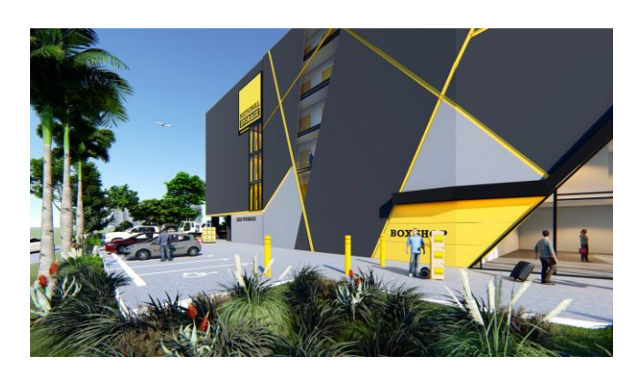
National Storage Biggera Waters (Concept)