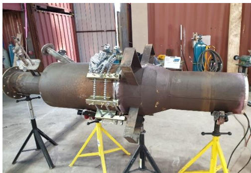
Fluid bed roaster repairs are underway at Compass Engineering's workshop