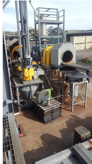
Dust slurry feed preparation area