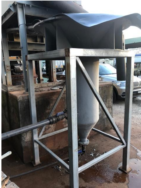
Fluidised furnace dust slurry feed tank