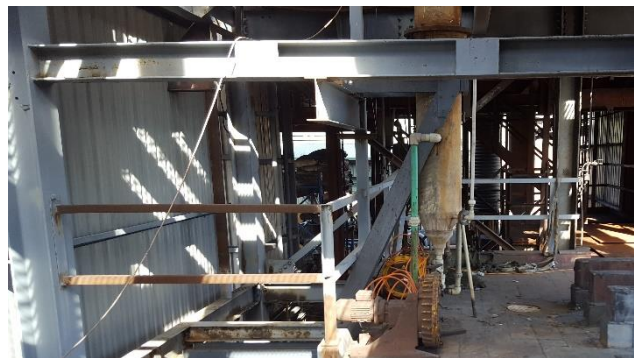
The fluid bed roaster will be installed to the left of the relocated roaster gas scrubber