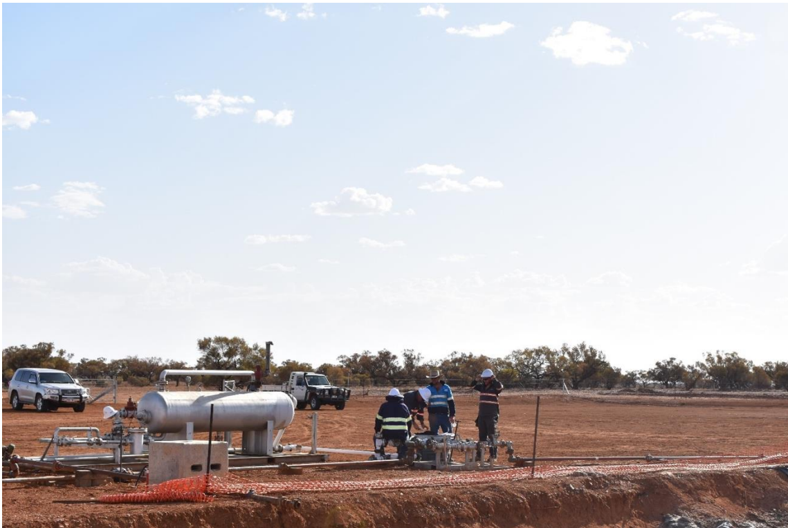
Figure 1: Flow testing operations underway on Tamarama 2 well

Sustained gas flows over 4 week period from the Tamarama 3 well have been recorded and this well has now been shut in. A flow test will now be undertaken on Tamarama 2 well. The Company will undertake further evaluation on both wells.