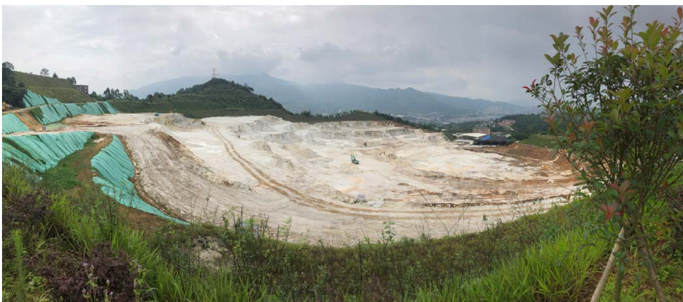
Figure 2 – Chinese kaolin mine requiring Carey's Well ore for production consistency

Additional ceramic industry application testing of DSO and dry-processed material is also in progress with a number of significant companies located in Japan and India, while evaluation of the material as a cracking catalyst for the petrochemical industry is being conducted by a large Chinese company.