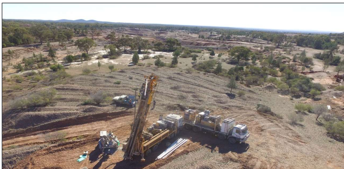
Figure 1: Oblique aerial view of RC drilling rig, showing extensive historic Tallebung open cut workings in background

The second drill rig arrived on site on the 19 July and will complete an initial ~1,300m diamond core programme targeting porphyry-style tin mineralization beneath the outcropping tin lodes (Figure 2). Based on normal core drilling production rates, this phase of drilling is expected to be completed in approximately 4 weeks.