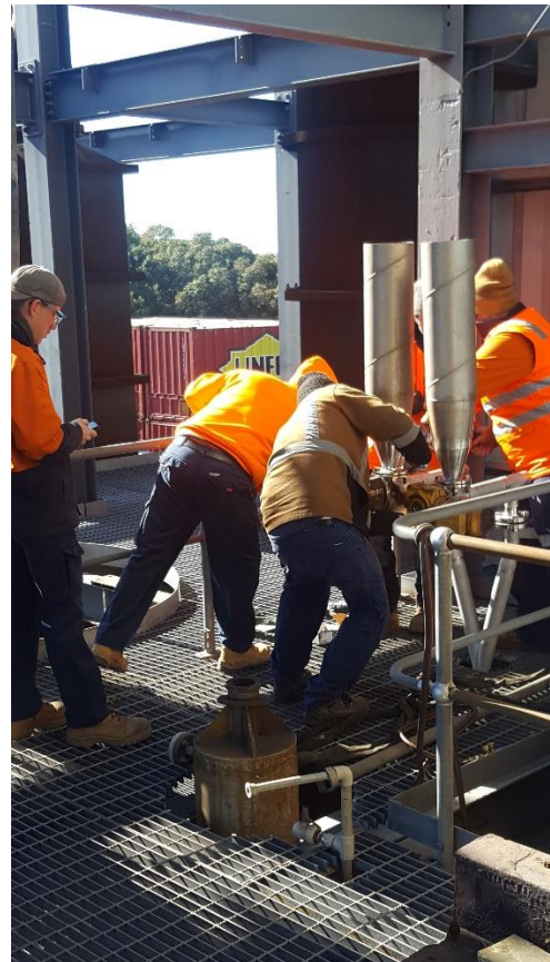
Installation of the hoppers for pellets and coal which is fed into the FB Roaster via double-dump valves