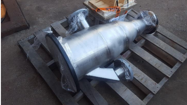
The upgraded EVAP plenum pre-installation

As illustrated in the photos below, installation of the equipment is on schedule. The EVAP unit will be ready for commissioning and production of the pellets will commence in August. Installation of the fluid bed roaster and ancillary equipment will continue so it will be ready for commissioning once the EVAP production run is finished.