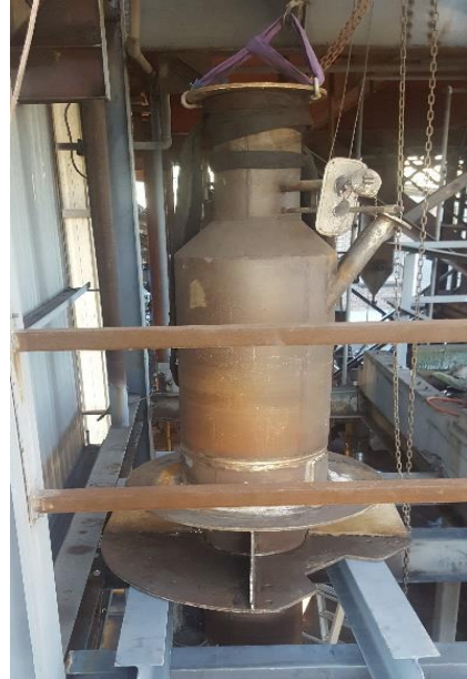
Installing the upper body of enhanced FB Roaster