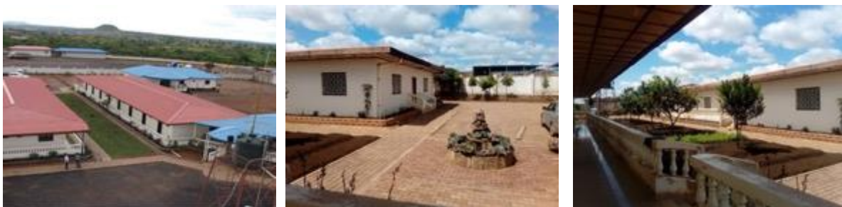
Images 16, 17 and 18: The Luapula Processing Facility Offices and Accommodation

The Luapula Processing Facility was initially operated to produce a predominantly copper hydroxide concentrate that was sold into both domestic and international markets. 100% of the ore feed to the facility was purchased from third parties, including local Congolese mining companies and co-operatives.