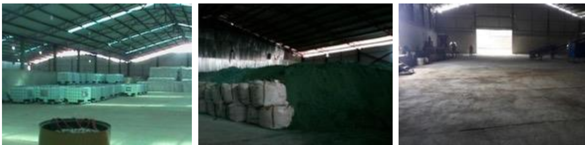
Images 13, 14 and 15: The Luapula Processing Facility Warehouse and Product Stockpiling