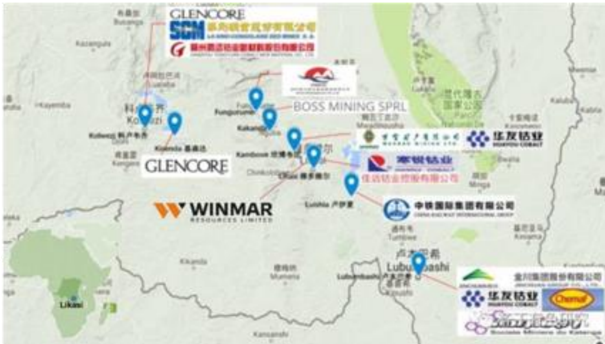
Map 1: Location of the exploration licenses and Luapula Processing Facility in the centre of the DRC Copperbelt, the world's largest cobalt producing region.

Likasi is located in the heart of the DRC Copperbelt, mid-way between the main mining towns of Kolwezi to the west and Lubumbashi to the south-east. Likasi is the technical headquarters for DRC state copper and cobalt mining company, La Générale des Carrières et des Mines ( Gécamines ).