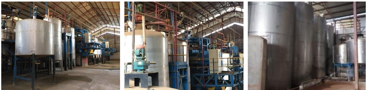
Images 10, 11 and 12: The Luapula Processing Facility Precipitation Section