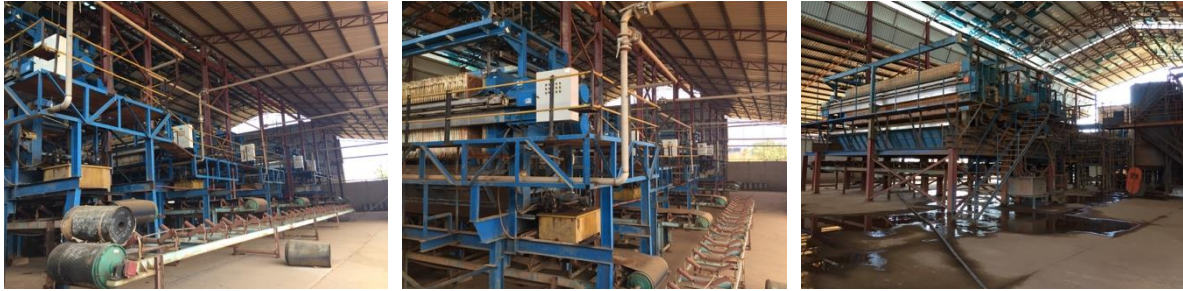
Images 7, 8 and 9: The Luapula Processing Facility Leaching and Leach Filter Sections