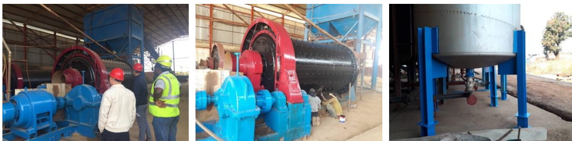
Images 4, 5 and 6: The Luapula Processing Facility Milling and Slurry Storage Sections

The Luapula Processing Facility has been designed with 7 distinct processes/sections.