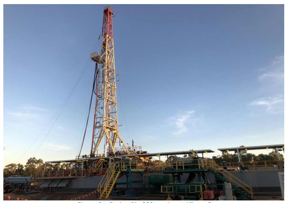
Figure 2 – Ensign Rig 932 on site at Albany 2

Albany 2 will be conventionally drilled to the top of the Lake Galilee Sandstone and then cored through the reservoir interval. Figure 2 is a recent photograph of Ensign Rig 932.