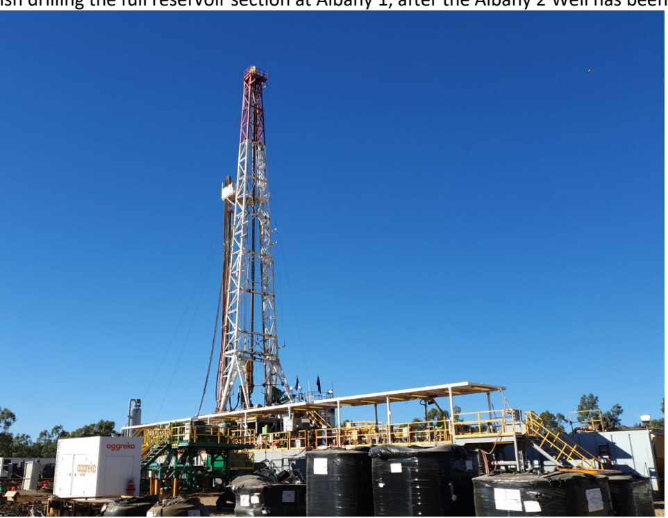
Figure 2 – Ensign Rig 932 on site at Albany 2

The gas flow from Albany 1 in 2018 is significant as it represents the first measured gas flow from the Lake Galilee Sandstone reservoir in the Galilee Basin. The results from Albany 1 were very encouraging and the GDJV will finish drilling the full reservoir section at Albany 1, after the Albany 2 Well has been drilled.