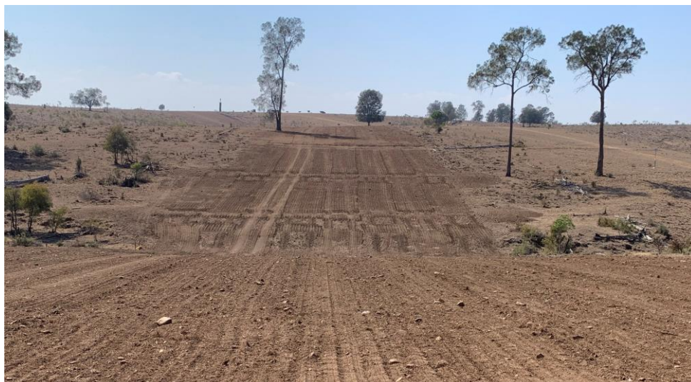
Project Atlas natural gas pipeline route following completion and rehabilitation