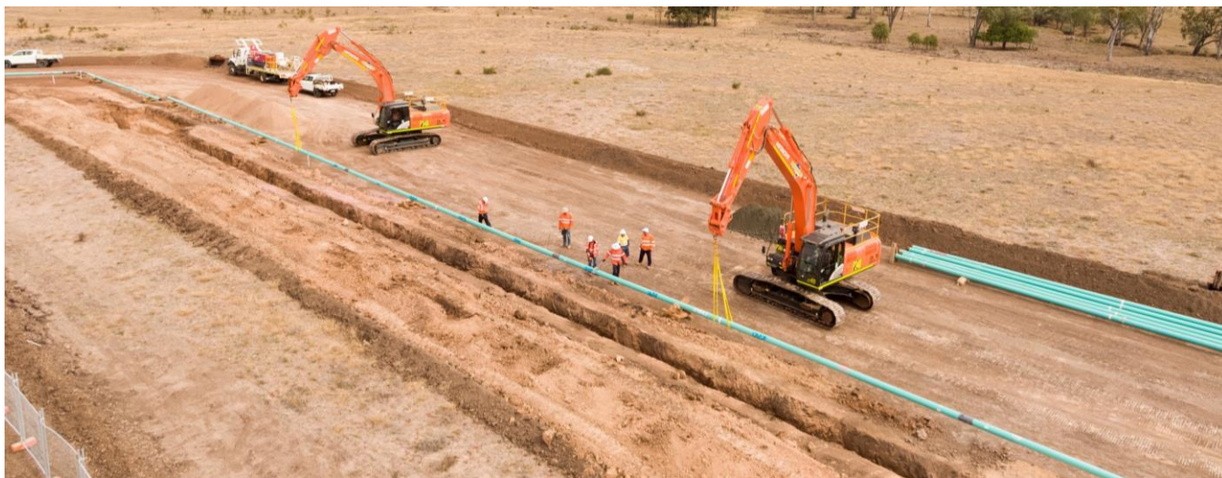
The first pipe is laid at Project Atlas in July 2019