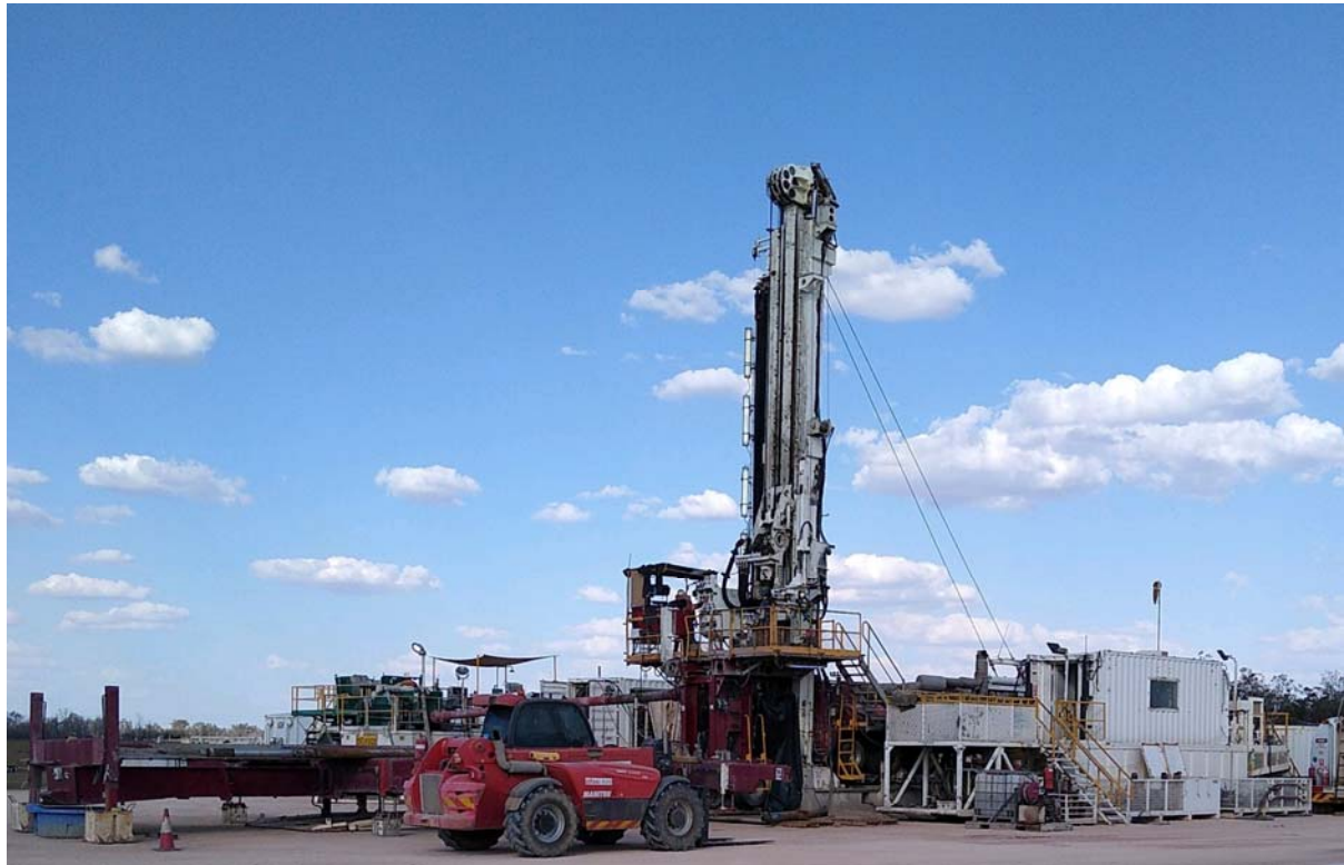
Photo 1 - Silver City Drilling Rig 20 on location of the Armour Energy Horeshoe 4 well