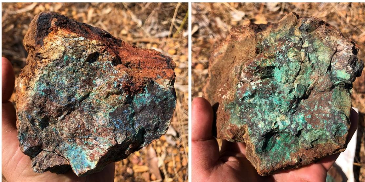
Figure 2: Rock chips from the outcropping copper rich gossan at the Rufina Targets located at ~610815E, 8167715N GDA94 MGAz51 (assays pending)