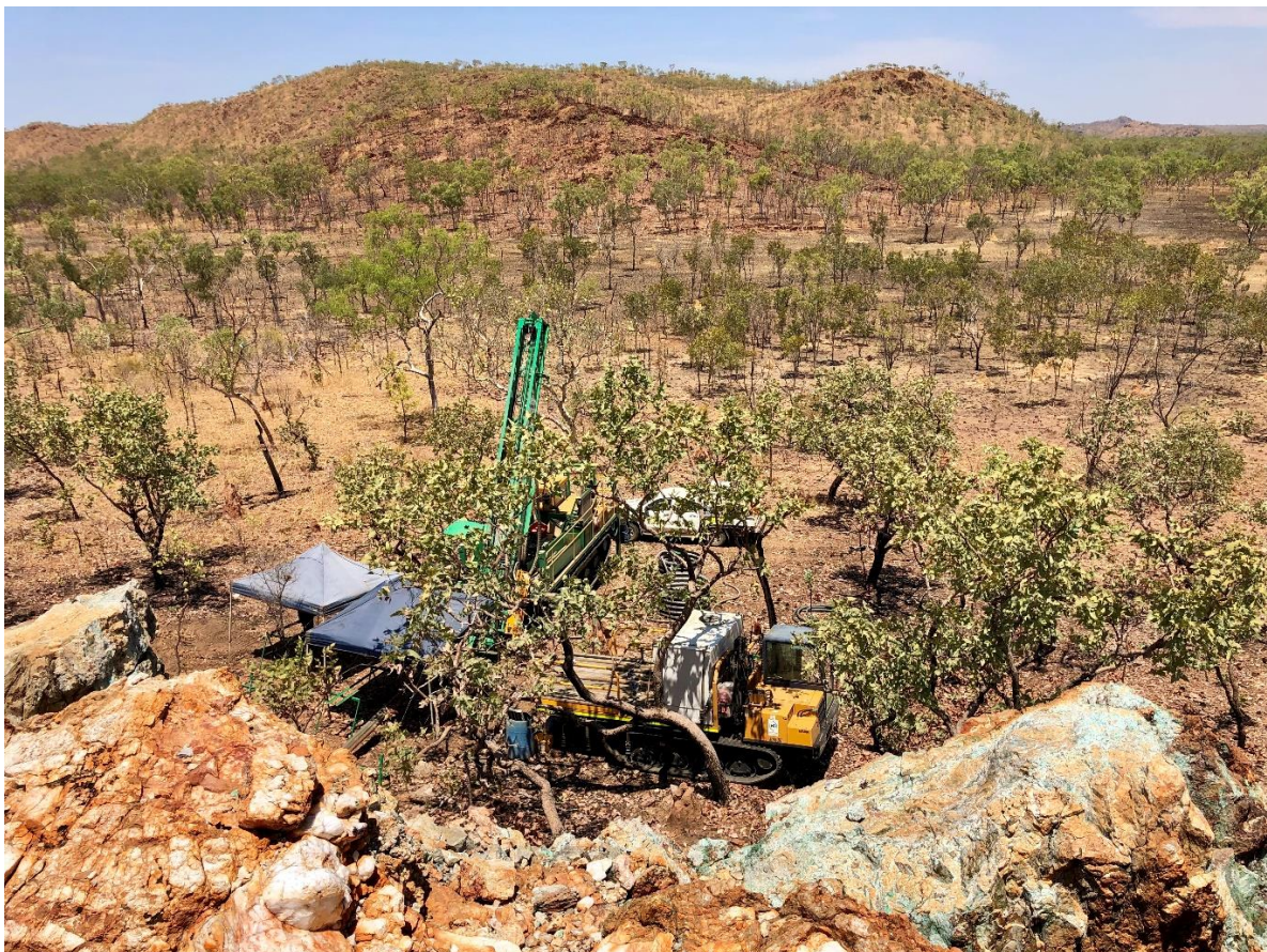
Figure 3: View from on top of the copper lode at Grants looking down on the small footprint drill rig.

Drilling is currently ongoing at the first drill hole at the Grants Cu-Au Target.