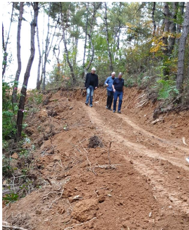
Photo 1: Recently constructed track up to the Bonanza Zone Drill Pad 1 (looking West)