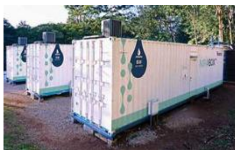
Fluence decentralised desalination plant

Our focus continues to be on investing in companies that are making a positive contribution to creating a sustainable future.