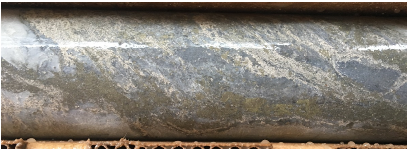
Figure 4: Closer view of Massive sulphide mineralised interception at hole BMZ79 at 456m downhole depth. Sulphide mineralisation both follows cross-cut primary foliation in the hosting rhyolite rock. Sphalerite is pale brown; chalcopyrite bright yellow. Pyrite completes the visible sulphide assemblage