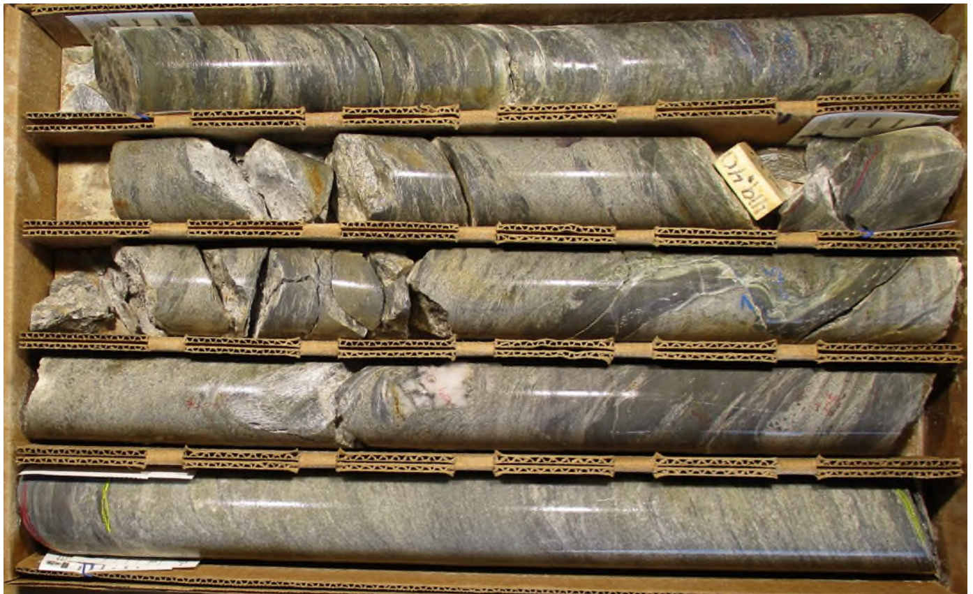
Figure 3: Massive sulphide mineralised interception at hole BMZ79 from 417.3 metres to 420.28 metres downhole depth. Sulphide mineralisation both follows cross-cut primary foliation in the hosting rhyolite rock. Sphalerite is pale brown; chalcopyrite bright yellow. Pyrite completes the visible sulphide assemblage