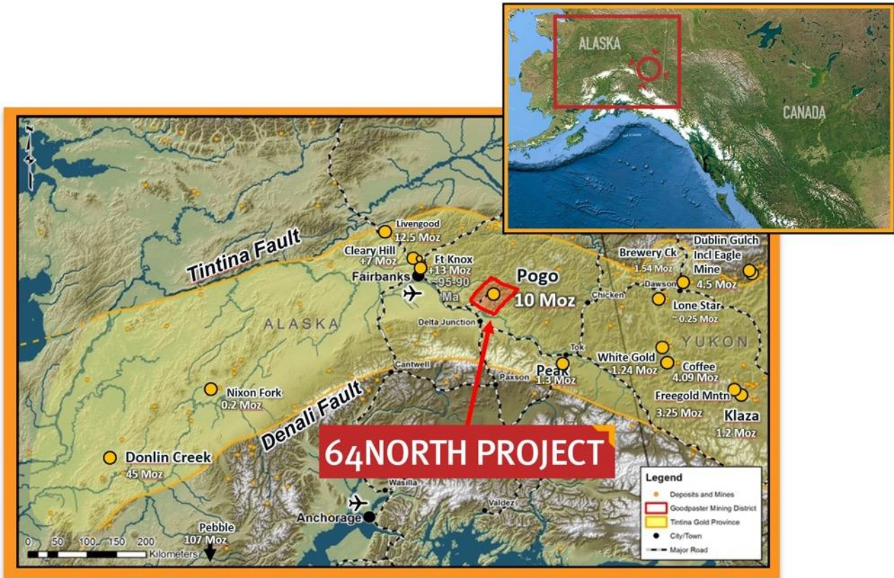
Figure 1 Tintina Gold Province, Alaska / Yukon, North America.