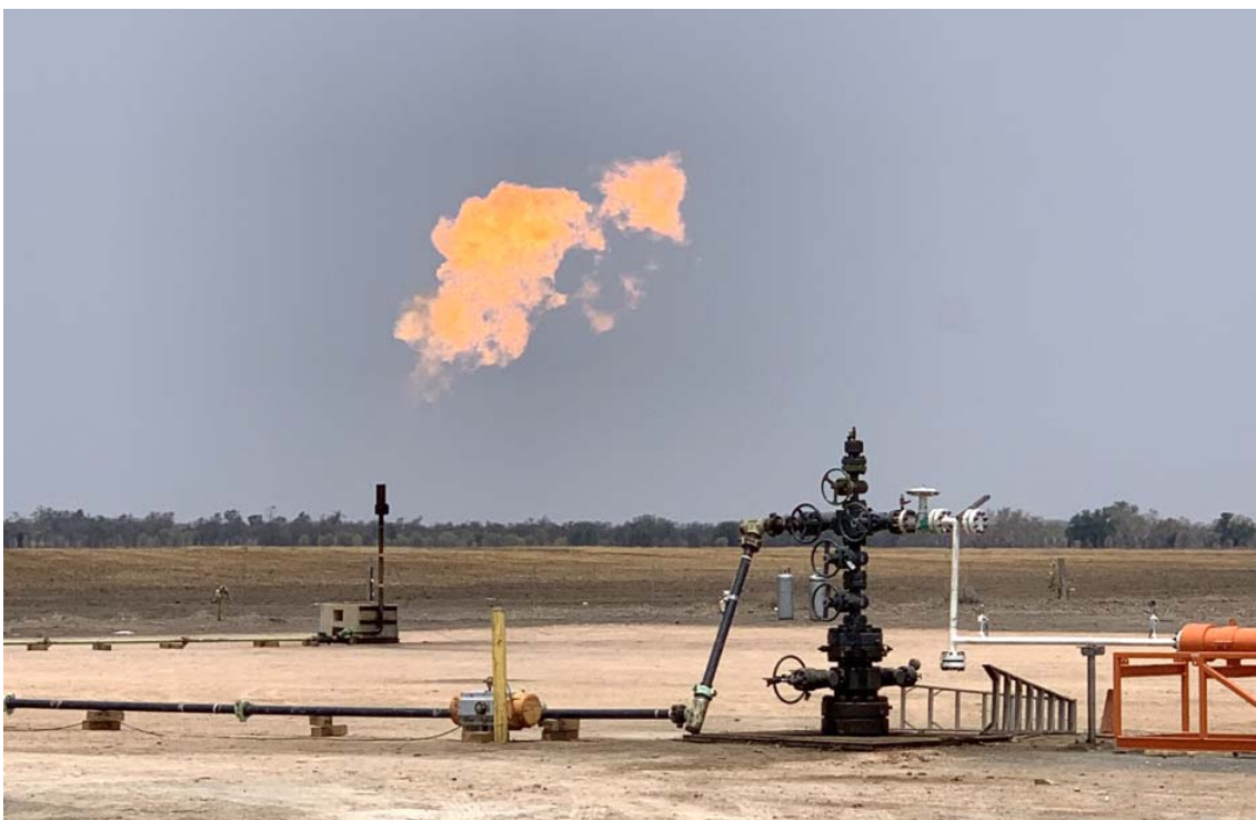
Myall Creek #5A wellsite – flaring initial gas flows of 2.3 MMCFD during flow back operations (photo taken at approximately 1pm 23 December 2019)