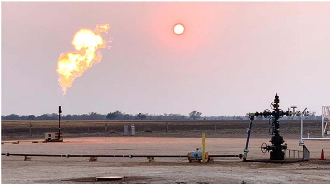
Myall Creek #5A wellsite – flaring initial gas flows of 2.1 MMCFD during flow back operations (photo taken at approximately 6am 23 December 2019)