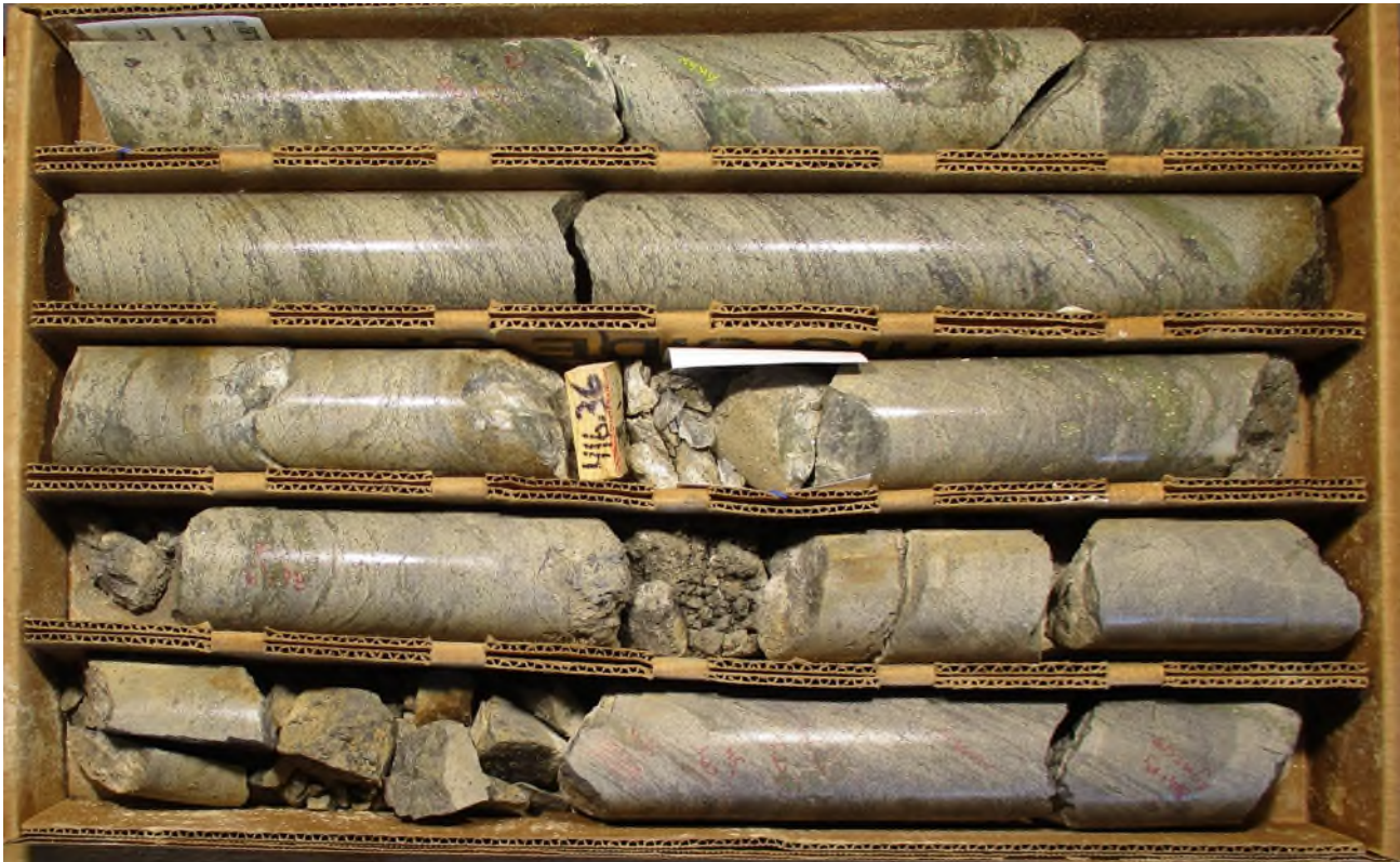
Figure 3: Massive sulphide mineralised interception at hole BMZ79 from 414.96m to 417.30m downhole depth corresponding to the highest zinc grade interval returned by this hole, 3.05m at 49.60% zinc, 1.39% copper, 0.91 g/t gold and 30 g/t silver from 414.65m. Massive Sulphide mineralisation mostly follows primary foliation in the hosting rhyolite rock. Sphalerite is pale brown; chalcopyrite bright yellow. Pyrite completes the visible sulphide assemblage.