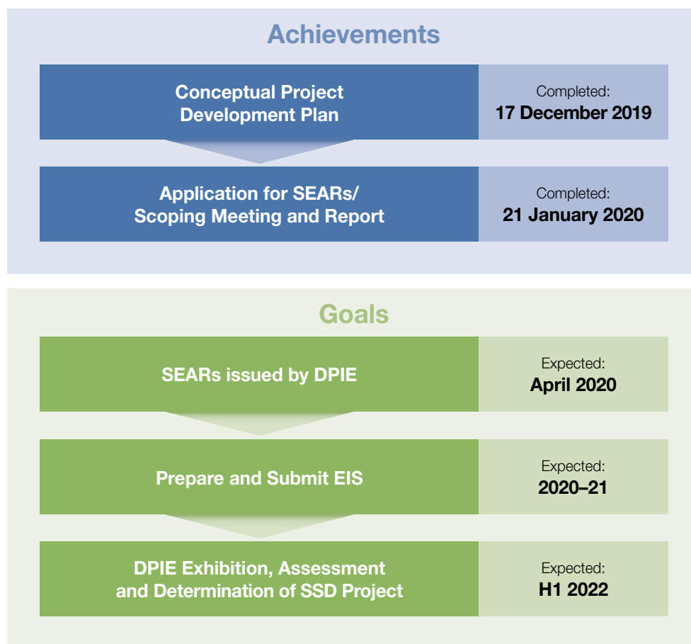
Figure 1. SSD Application major steps flowchart.

It is expected that the EIS will be lodged with DPIE for exhibition and assessment during 2H 2021, however delivery will be influenced by technical and optimisation studies undertaken during the FS. COB will inform all stakeholders via announcements and the media when the EIS will be on exhibition.