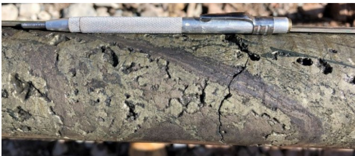
Figure 4: Massive sulphide from CHDD001 61.4m-61.9m grading 6.0% Zn, 0.7% Pb, 0.2% Cu, 14.1 g/t Ag.

Dreadnought has now defined seven FLEM plates with associated outcropping gossans, magnetic anomalies and/or soil anomalies. It is planned that each of these targets will be drilled in the June 2020 quarter, weather permitting.