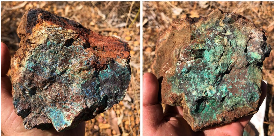
Figure 1: Rock chips CHWR01 (L) 25.6% Cu, 678g/t Ag and 1.3 g/t Au and CHWR02(R) 26.7% Cu, 371 g/t Ag and 0.5 g/t Au from the outcropping copper rich gossan at the Rufina North target located at ~610815E, 8167715N GDA94 MGAz51