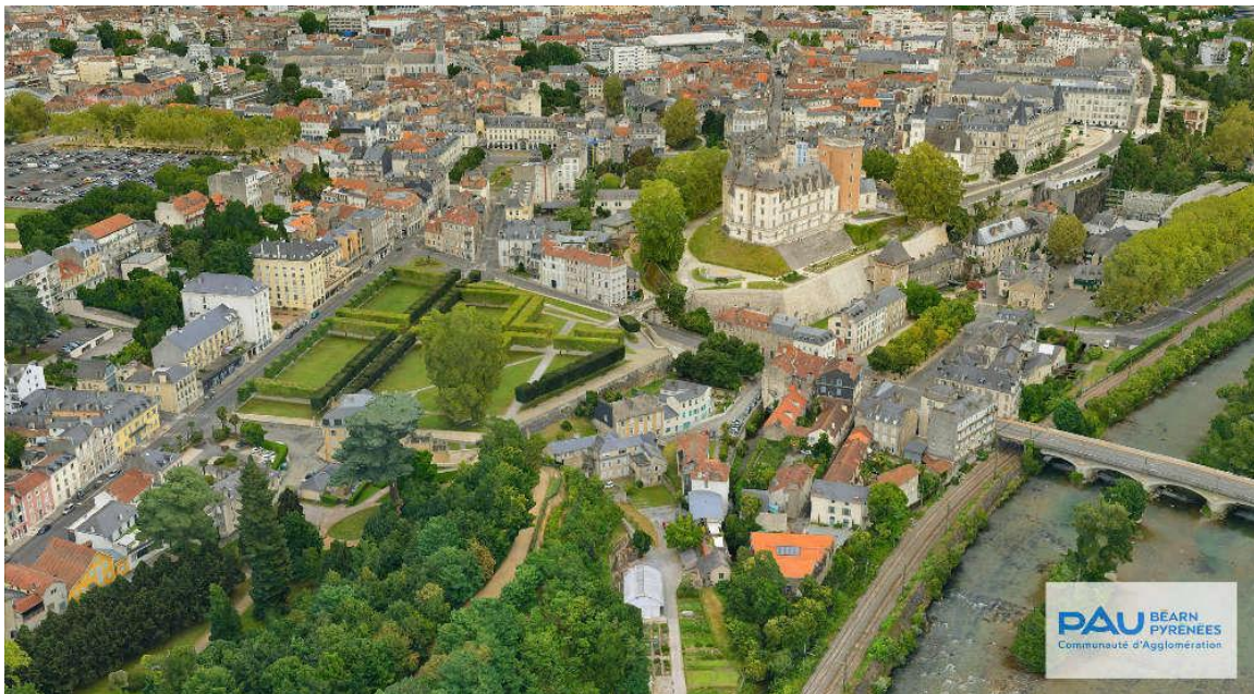
Figure4. The reconstruction of the castle district with the 3D model.