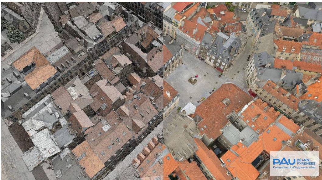
Figure 2. Place Marguerite reconstructed in 3D. On the left, the mesh before applying the photos.