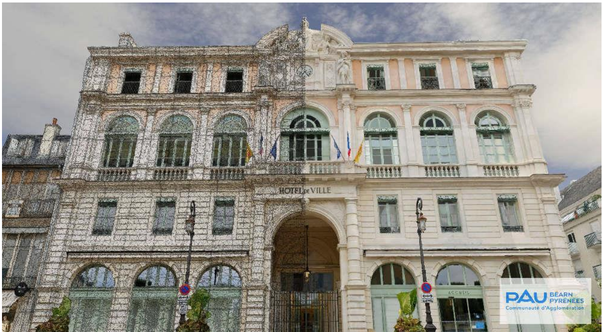
Figure 6. The city hall reconstructed in 3D model.