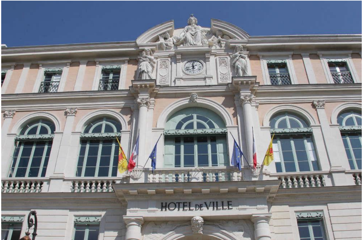
Figure 5. A photo of the town hall