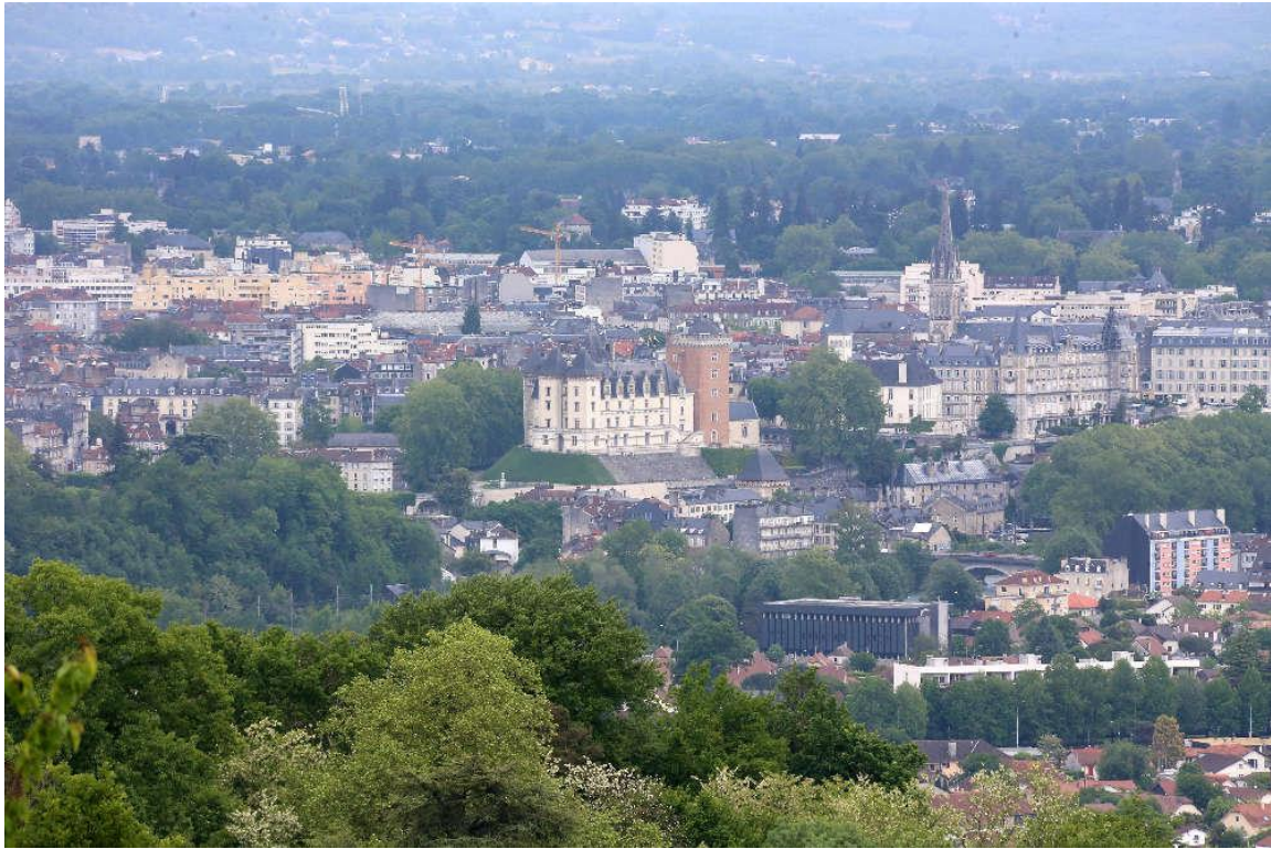
Figure 3. An aerial photo of the castle district