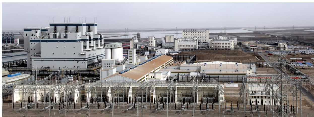
Picture: Qinghai Salt Lake Magnesium Co. Ltd electrolytic magnesium project at Golmud in Qinghai Province PRC. The Magontec Qinghai magnesium alloy cast house is part of this complex.

To view the FY2019 Magontec Limited Annual Report and for more information on Magontec Limited please visit our website at www.magontec.com