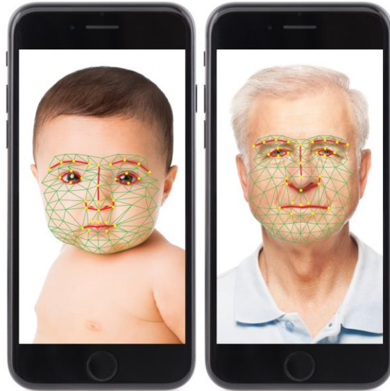
PainChek® artificial intelligence assesses facial micro-expressions that are indicative of the presence of pain.

To find out more, visit www.painchek.com