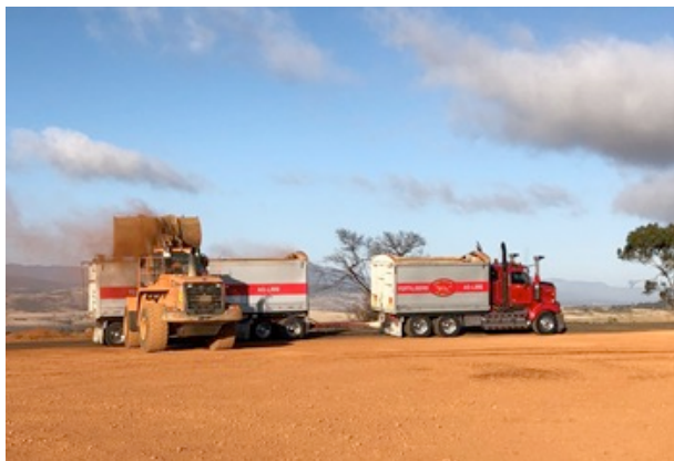
Figure 4: Loading Fertiliser-Grade bauxite at ABx's Bald Hill certified clean load-out facility.

The customer's trucks will load and transport the fertiliser-grade bauxite product over coming weeks.