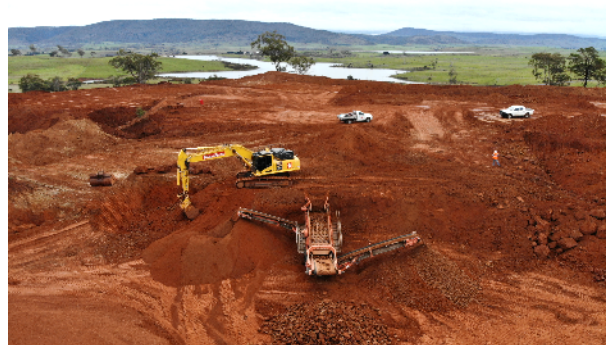
Figure 3 (right): Mining and directly feeding into an in-pit screen

ABx has remained focussed during the COVID-19 pandemic response which had threatened our business because our bauxite customers were suffering setbacks. We are now proud to advise that during April-May 2020, ABx was able to secure sales contracts for fertiliser-grade bauxite and cement-grade bauxite that totalled more than $2.5 million.