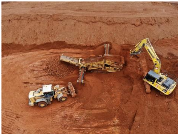
Figure 1 (below) & Figure 2 (right): Screening ore from previously mined stockpiles

Australian Bauxite Limited (ASX: ABX) is pleased to advise that mining and screening operations are well advanced at its Bald Hill mine near Campbell Town northern Tasmania and trucking to port has commenced to assemble the next cargo of cement-grade bauxite to our customer's specifications.