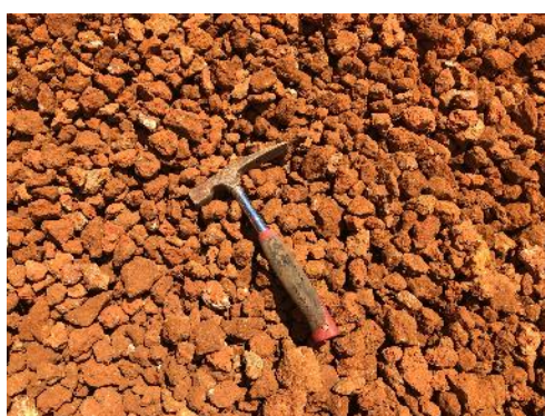
Figure 7: Cement-grade blended product