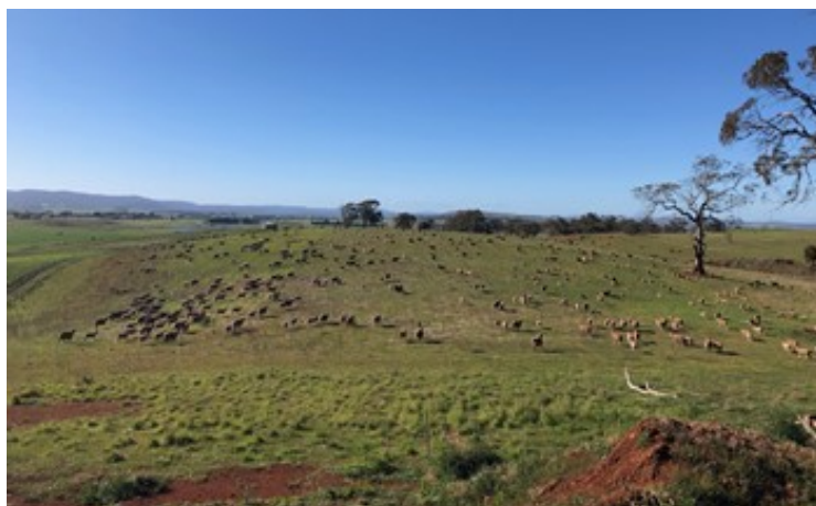
Figure 8: Sheep grazing on rehabilitated land two years after mining commenced at the Bald Hill bauxite mine, Tasmania

ABx endorses best practices on agricultural land, strives to leave land and environment better than we find it.