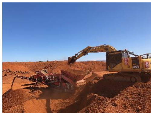
Figure 6: Screening cement & fertilizer grade products