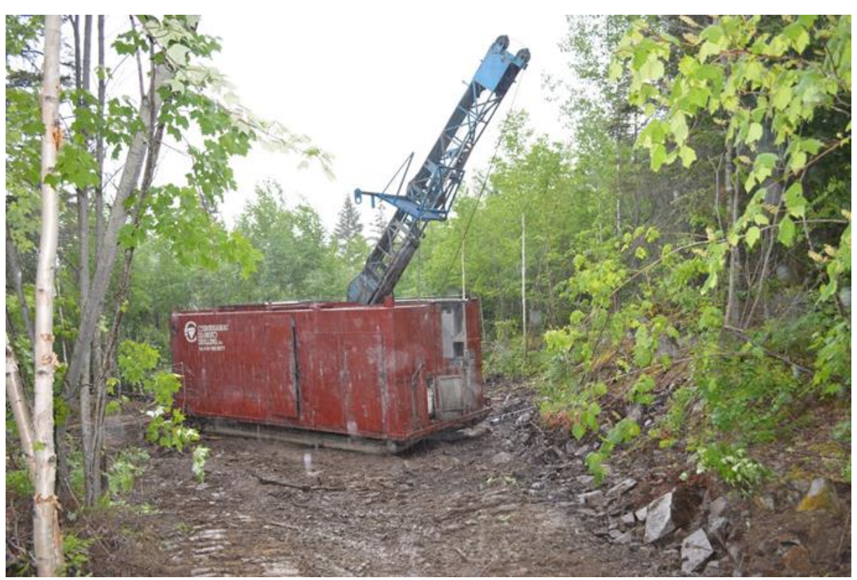
Figure 1: CDD enclosed skid-mounted diamond drilling rig set up on site ZA-20-01

• There were no objections lodged by the relevant First Nations and the 'Permis d'intervention' permit for the planned drilling programme to proceed after completion of the Alotta Project drilling has been received.