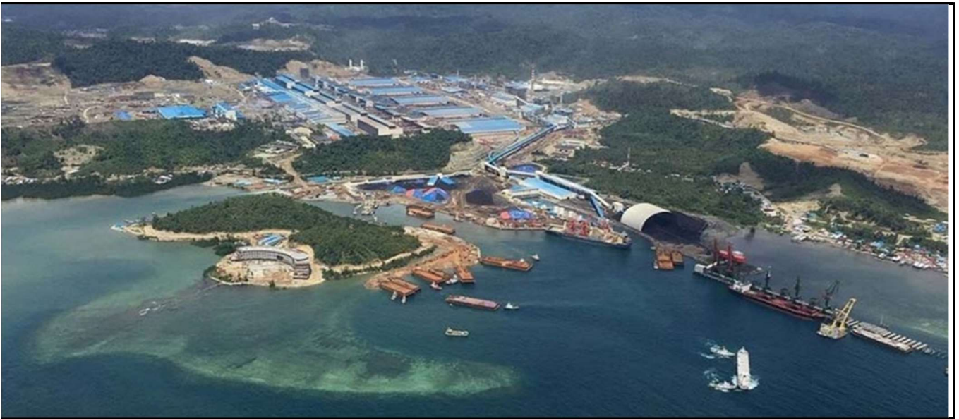
Aerial photo of the IMIP

Nickel Mines also holds an 80% interest in the long life, high grade Hengjaya nickel mine located in Morowali Regency, Central Sulawesi, Indonesia just 12 kilometres from the IMIP.