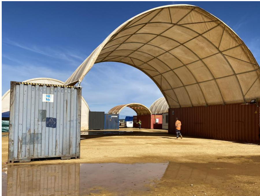
Figure 1. Jemalong Solar Project hangers.

Our second development project, Jemalong Solar Project, continues to progress in accordance with the construction timetable, and subject to any unforeseen impact of COVID-19 on forthcoming construction activities, first generation is anticipated in Q4 of this calendar year. This is an important project for the Company as it has the potential to provide a step-change in Genex's revenues and will deliver geographic diversity to our renewable energy portfolio."