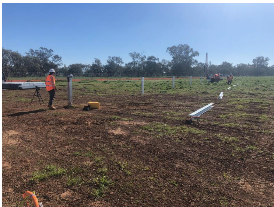
Figure 2. Piling at the Jemalong Solar Project.